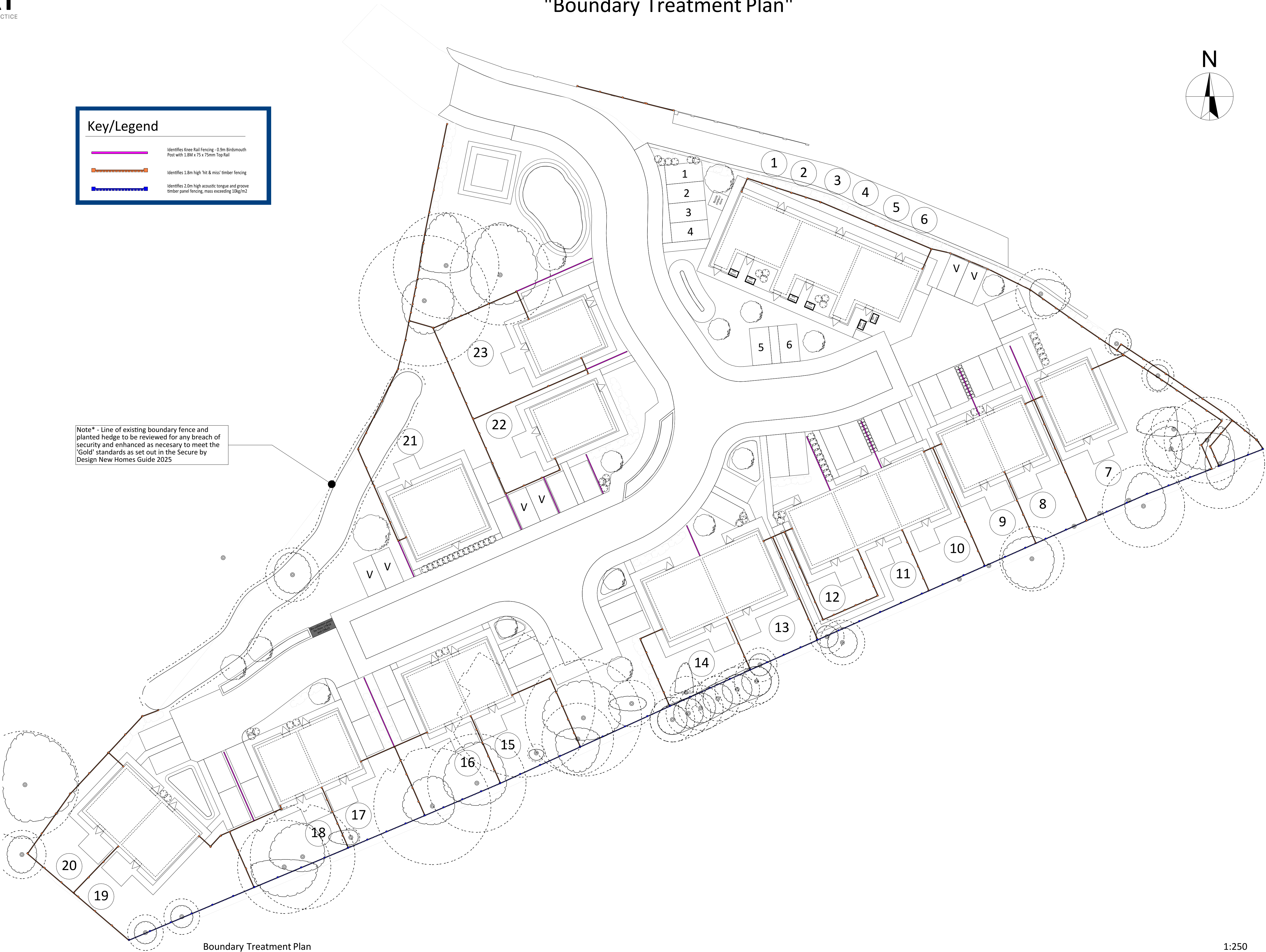
Boundary Treatment Plan

Note* - Line of existing boundary fence and planted hedge to be reviewed for any breach of security and enhanced as necessary to meet the 'Gold' standards as set out in the Secure by Design New Homes Guide 2025