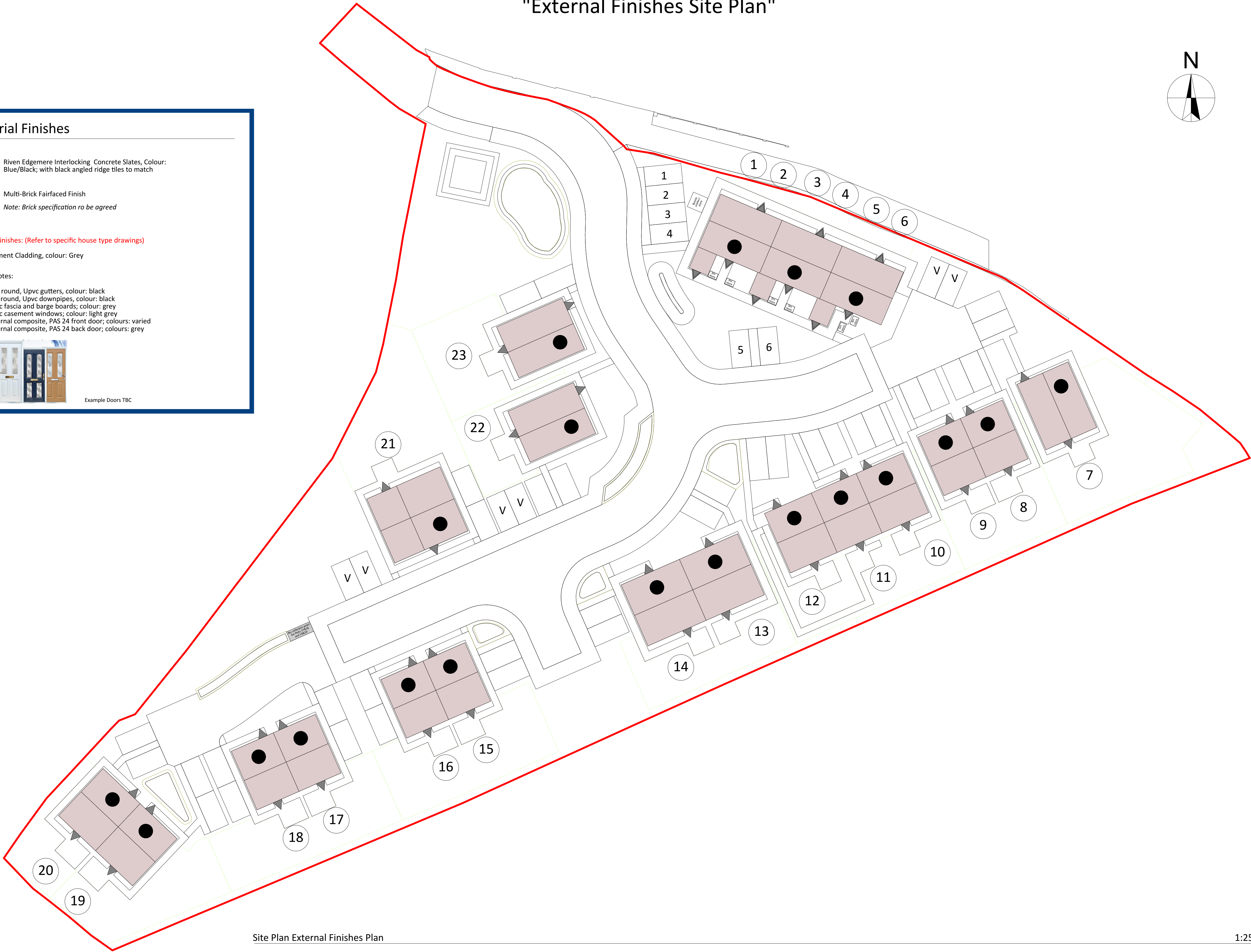
Site Plan External Finishes Plan