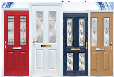
Example Doors TBC