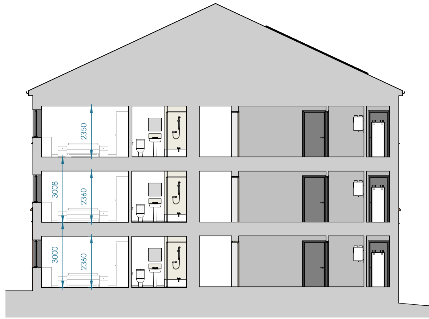
5 SECTION APARTMENTS 1 : 100

scan the qr code with your mobile phone camera for an illustrative video of the site panorama