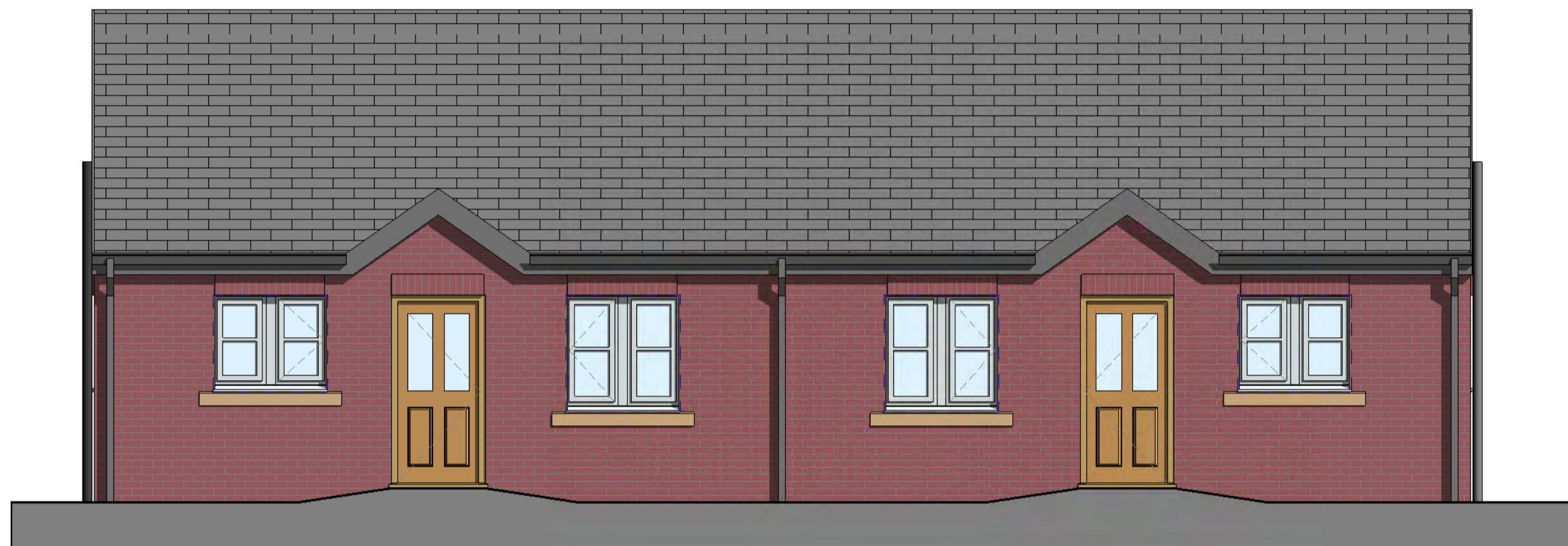
Front Elevation 1 : 50