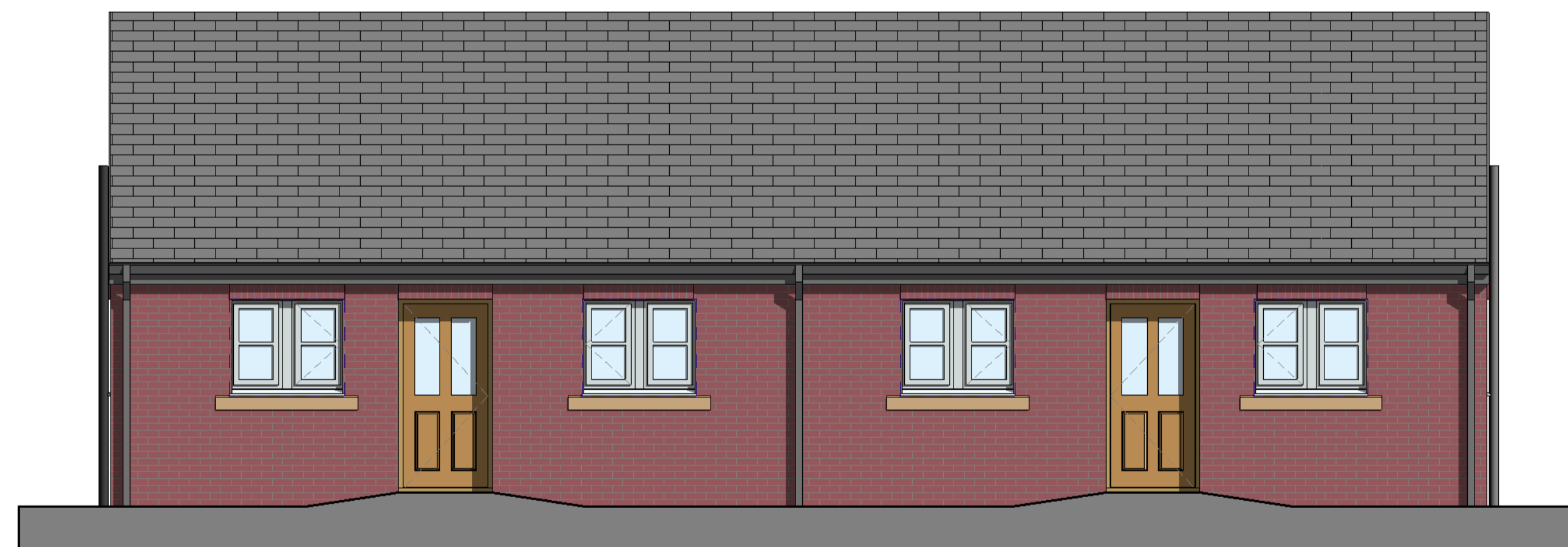
Rear Elevation 1 : 50