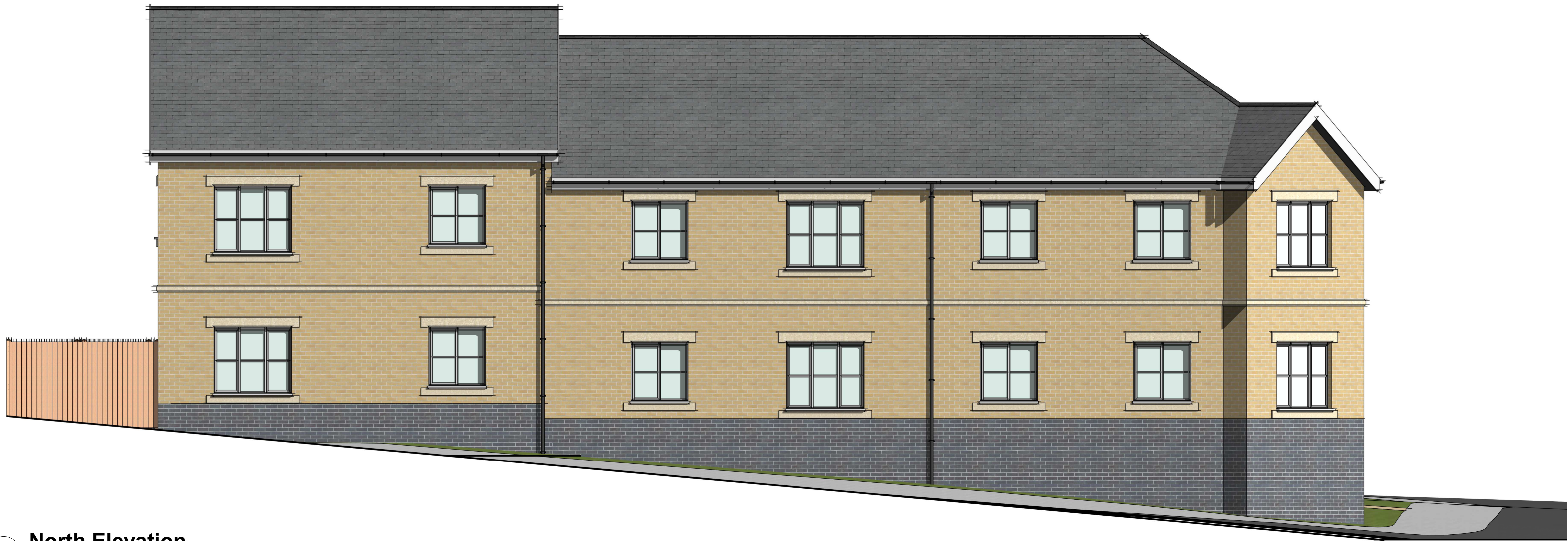
1 North Elevation 1 : 50