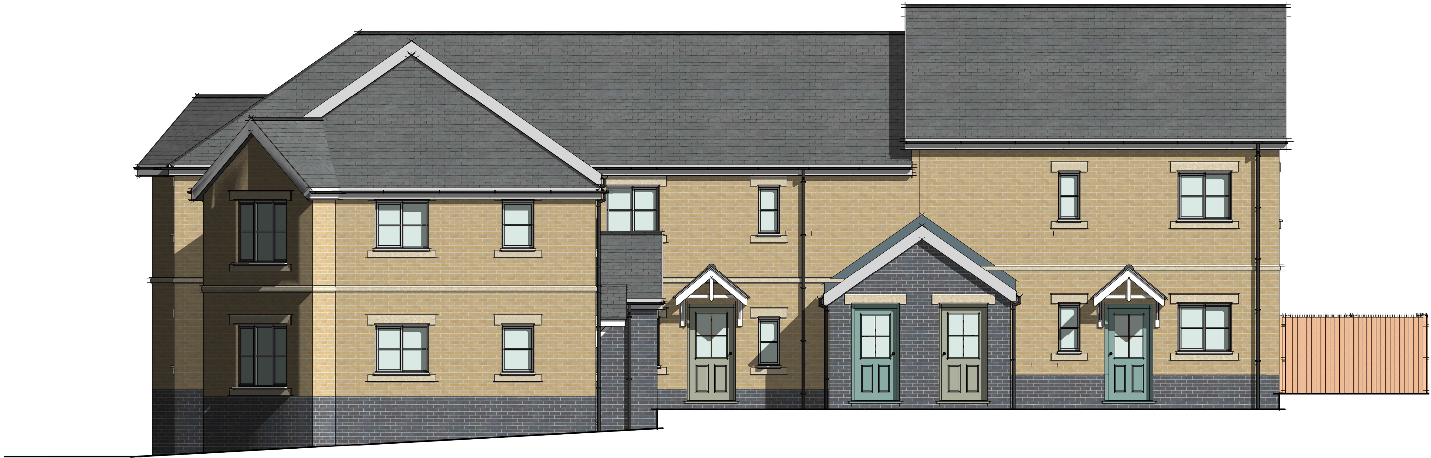
2 South Elevation 1 : 50